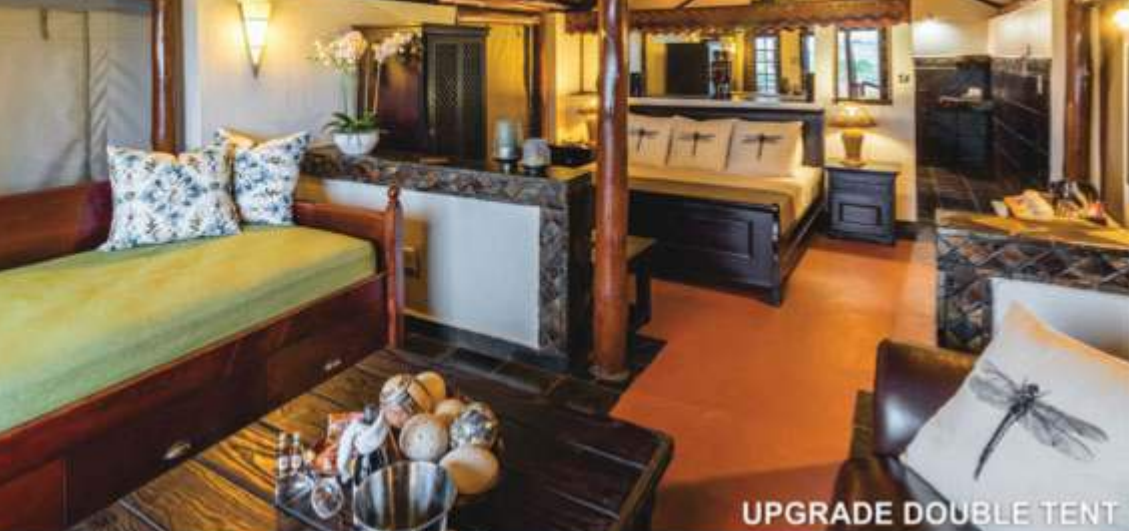
UPGRADE DOUBLE TENT