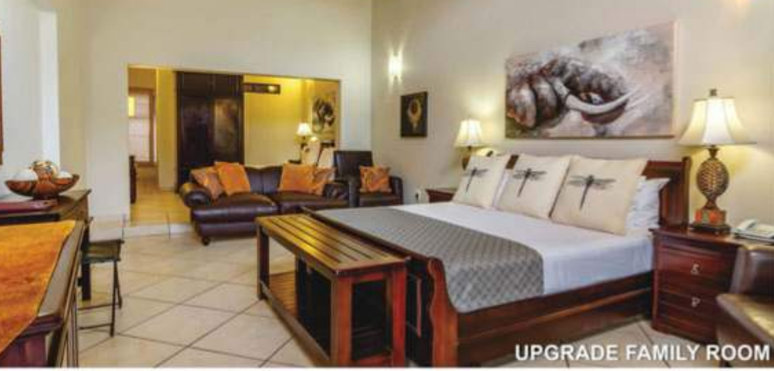
UPGRADE FAMILY ROOM