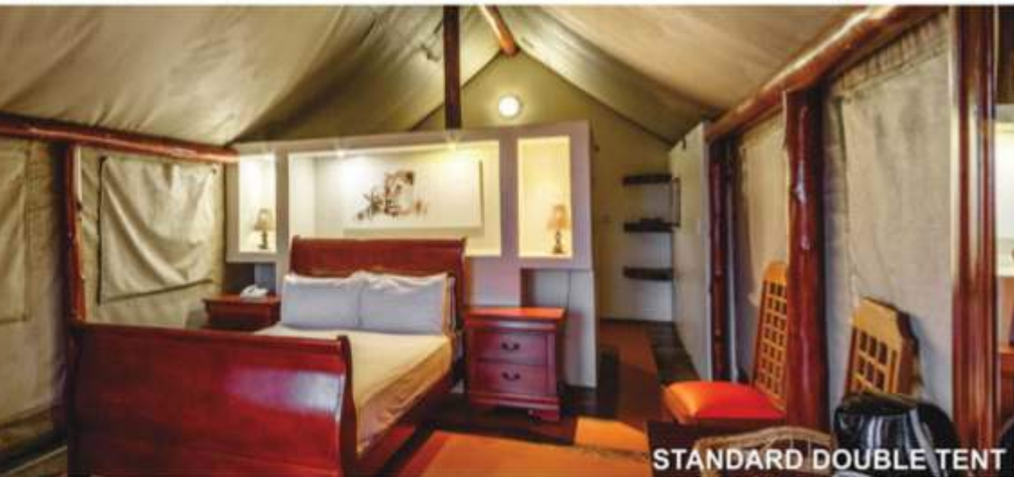
STANDARD DOUBLE TENT