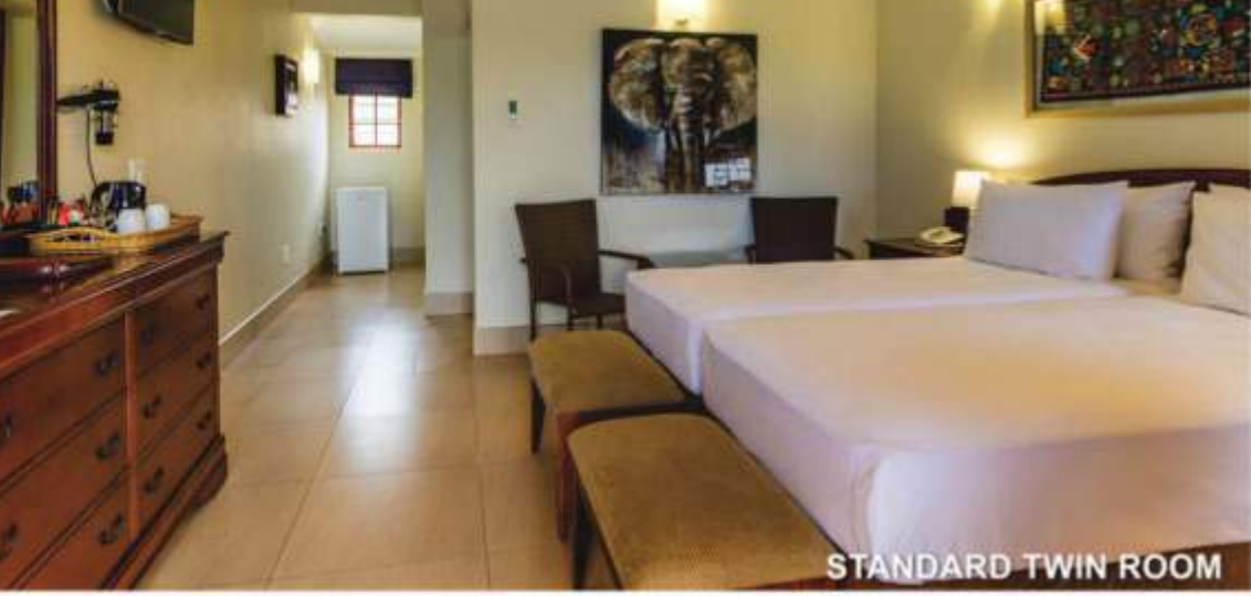
STANDARD TWIN ROOM