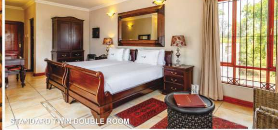
STANDARD TWIN DOUBLE ROOM