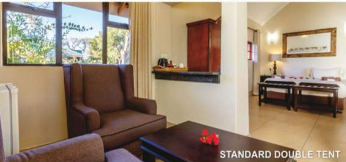
STANDARD DOUBLE TENT