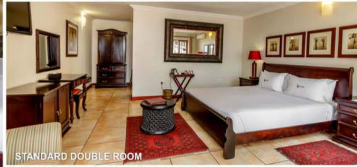
STANDARD DOUBLE ROOM