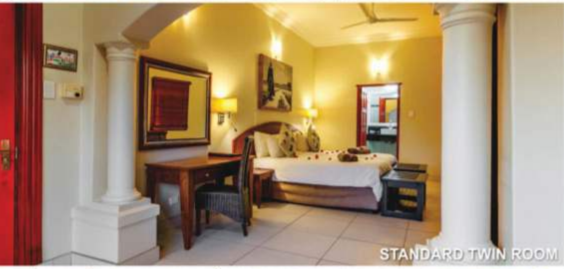
STANDARD TWIN ROOM