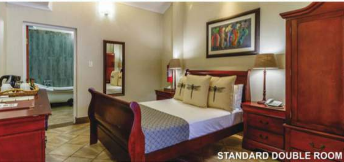
STANDARD DOUBLE ROOM